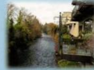
A view of Silver Creek, looking north from the Main Street Bridge in Silverton, Oregon